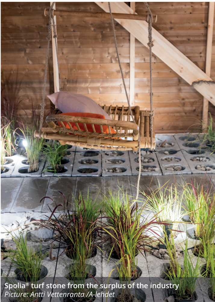
Spolia® turf stone from the surplus of the industry