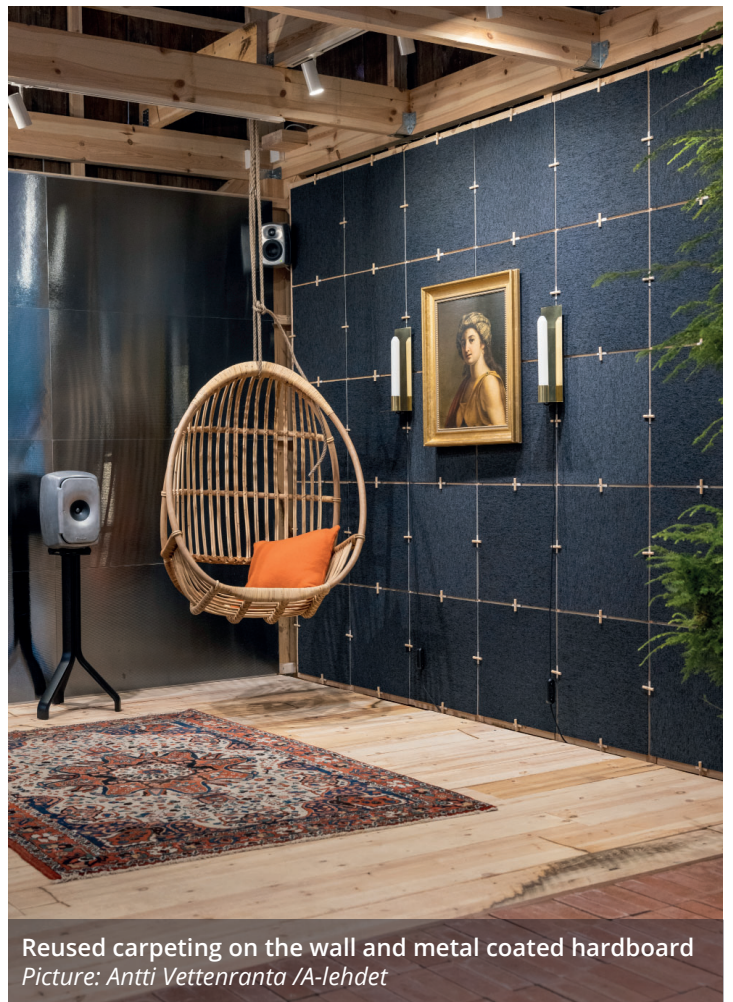
Reused carpeting on the wall and metal coated hardboard