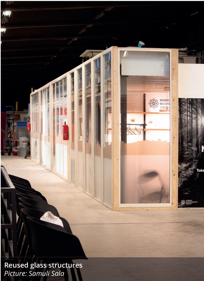
Reused glass structures

The products are Spolia® products acquired and refined from demolished buildings and industrial surplus